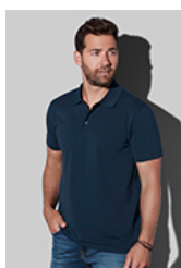
ST9060 Lux Polo